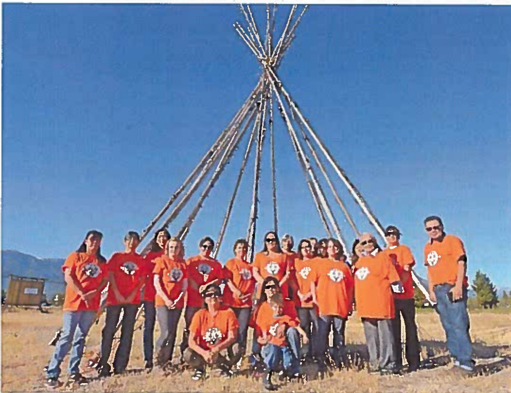
Shuswap Band Staff unite to show their support for Orange Shirt Day, a Canada-wide campaign to acknowledge the intergenerational impact of residential schools on children.